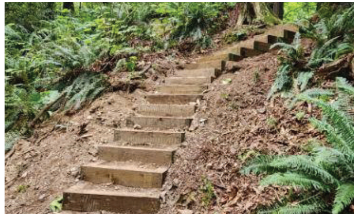
The stairs were replaced on the upper section of the Popkum Community Trail leading to Cheam Lake.

Construction of a new linear trail section in Area D began in mid-September to address safety concerns and ensure that walking paths are continuous.